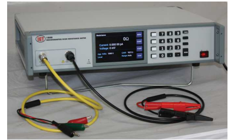
1888 Megohmmeter/IR Tester with standard cables