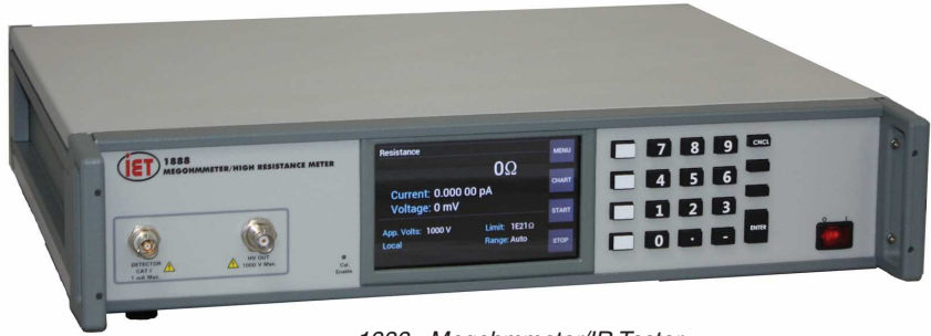
1888+ Megohmmeter/IR Tester

USB, Ethernet and GPIB interfaces allow for easy integration into an automated test system.