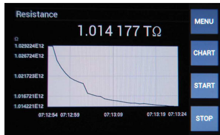
1888 Graphical Display

The 1888 makes full use of the graphical color touch screen to display data in both graphical and tabular format. This allows the user to view resistance over time.